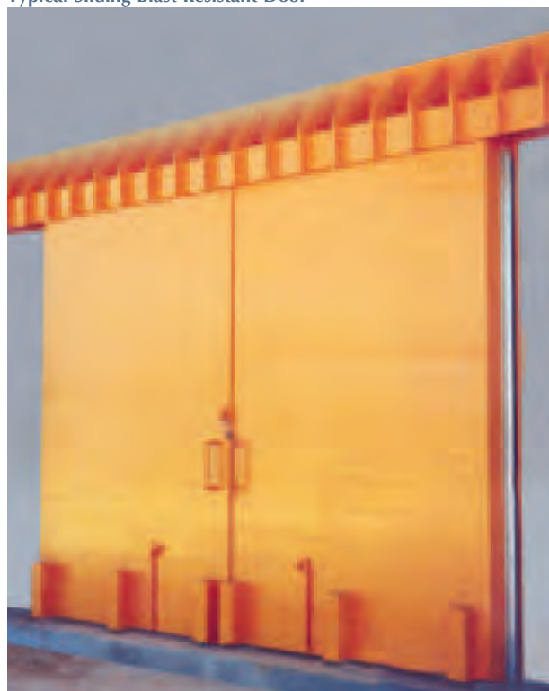
Typical Sliding Blast Resistant Door

BR-Series Swing door hardware includes modified builders hardware or factory manufactured locks and hinges as required by blast rating. Slide door hardware includes low friction tracks and rollers, low voltage control circuitry for electrical operators, and a variety of operator actuation devices.