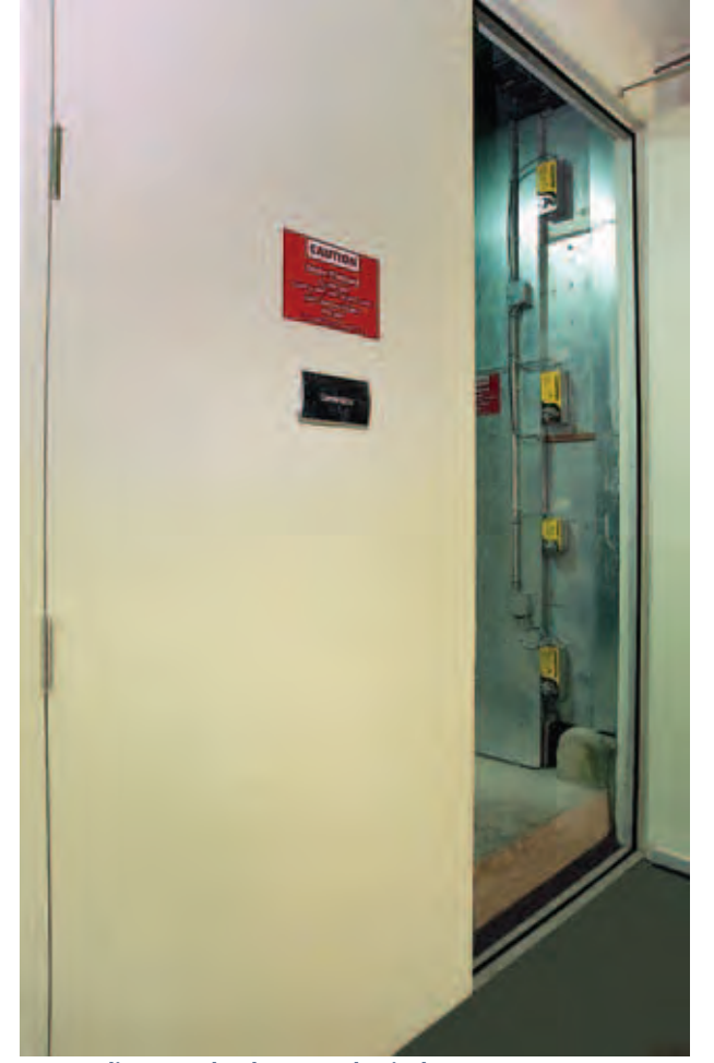
Metropolitan Hotel - Electromechanical Room