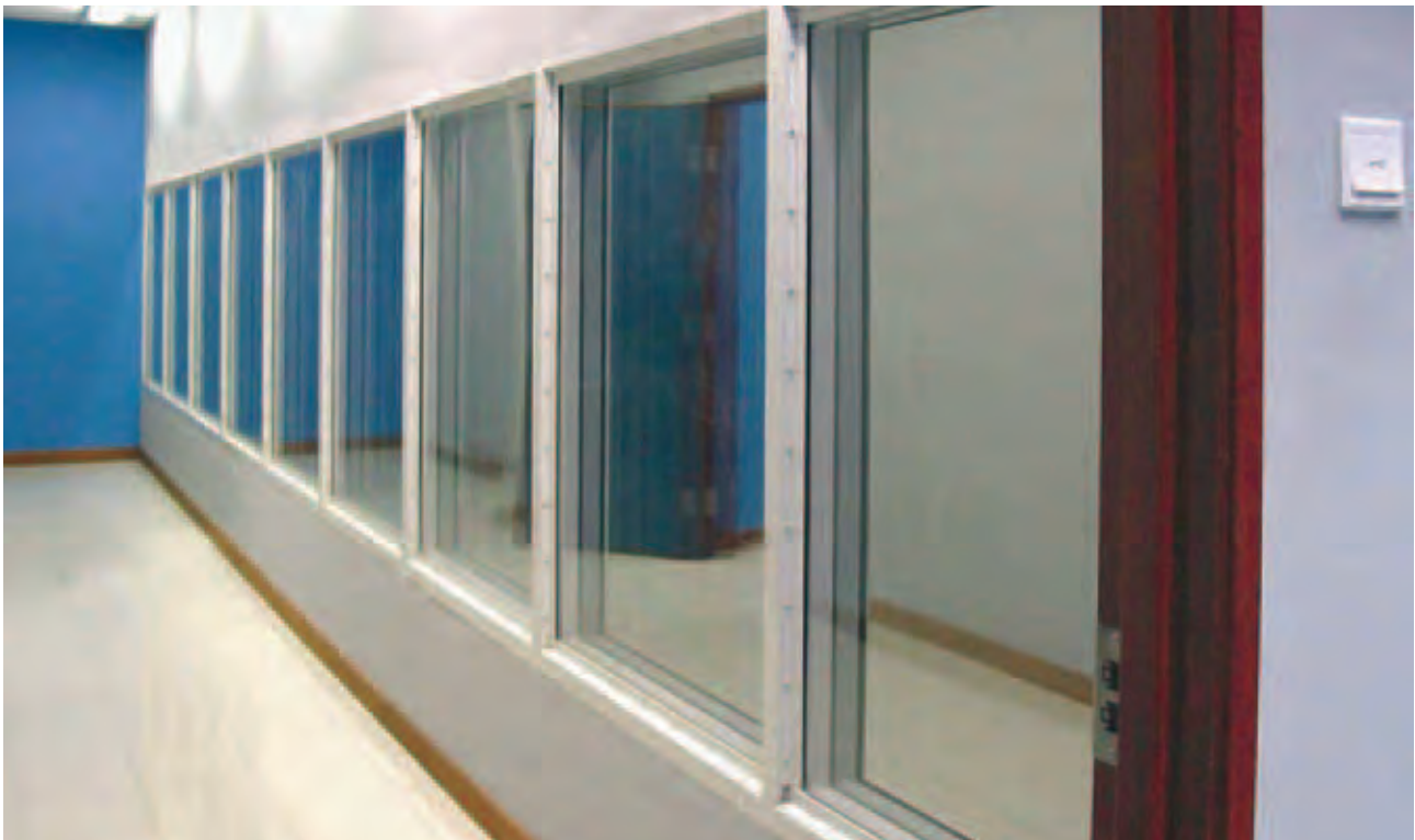
MOJ Prison - Thailand

Specifications and recommendations are available on an individual inquiry basis.