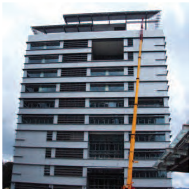
Immigration Detention Center - Hong Kong